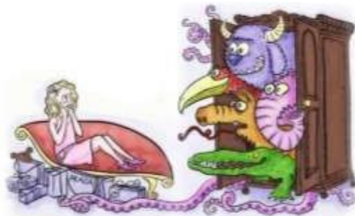
Figure 2 The monster invited all of his friends

The monster feels blessed when he tells the story of Mary's makeover service to his friend and they believe. The consequence of giving a donation because it can satisfy something is good but we need to be aware of someone to be used of our kindness to others.