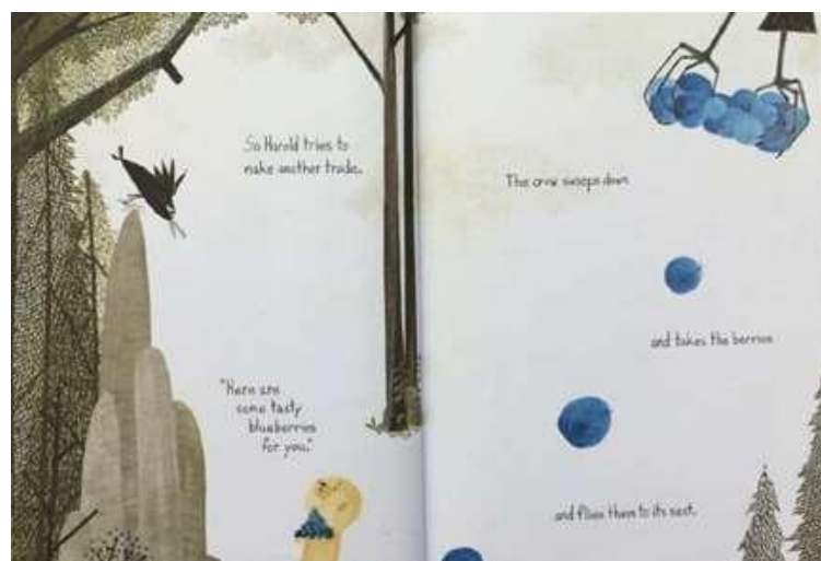
Figure 3 Harold tries to make another trade by offering blueberries.