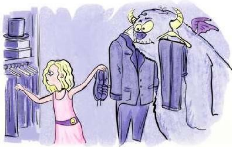
Figure 1 Little Mary gave the Monster her Dad's Outfit

There can also be a consequence of individuals that often think of optimism in their life. When they are faced with optimism that the action can run well but the reality is failed, they can be frustrated or have big regret on that. Being a positive person is always thinking optimistically that's a good point, but when they are faced with the opposite result, they need to learn about forgiveness.